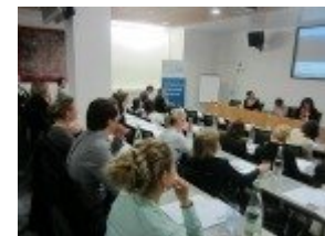
Swiss Affiliate Panel

The FIGT Swiss Affiliate continues to power ahead leading the way with panels and discussions on topics relevant to the global mobility industry as well as those in transition themselves. The latest event which discussed the sometimes confusing issue of repatriation was held in at the Vaud Chamber of Commerce and Industry in Laussane on Monday May 21st, and was sponsored by International Link CVCI.ch and Sterling.