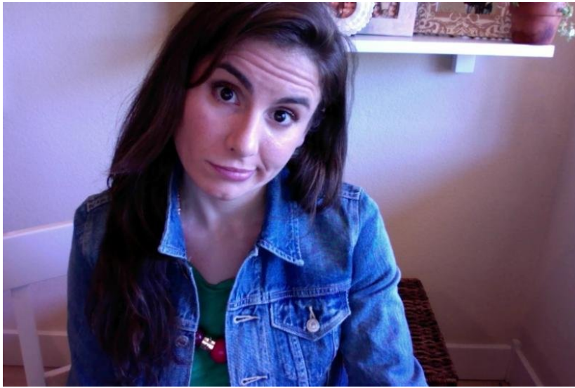
My Life - A Pin Ball Machine